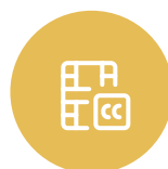
Dubbing and subtitling