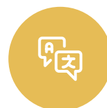
Speech To Text (STT)